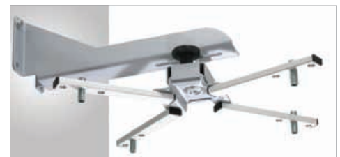
Kindermann Pro W