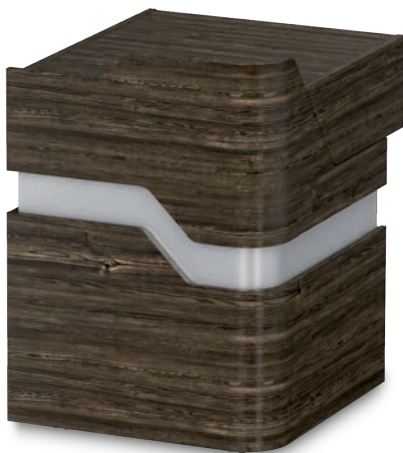
TeachPoint 2 single in wenge look

We will gladly support you in your plans. Contact us.