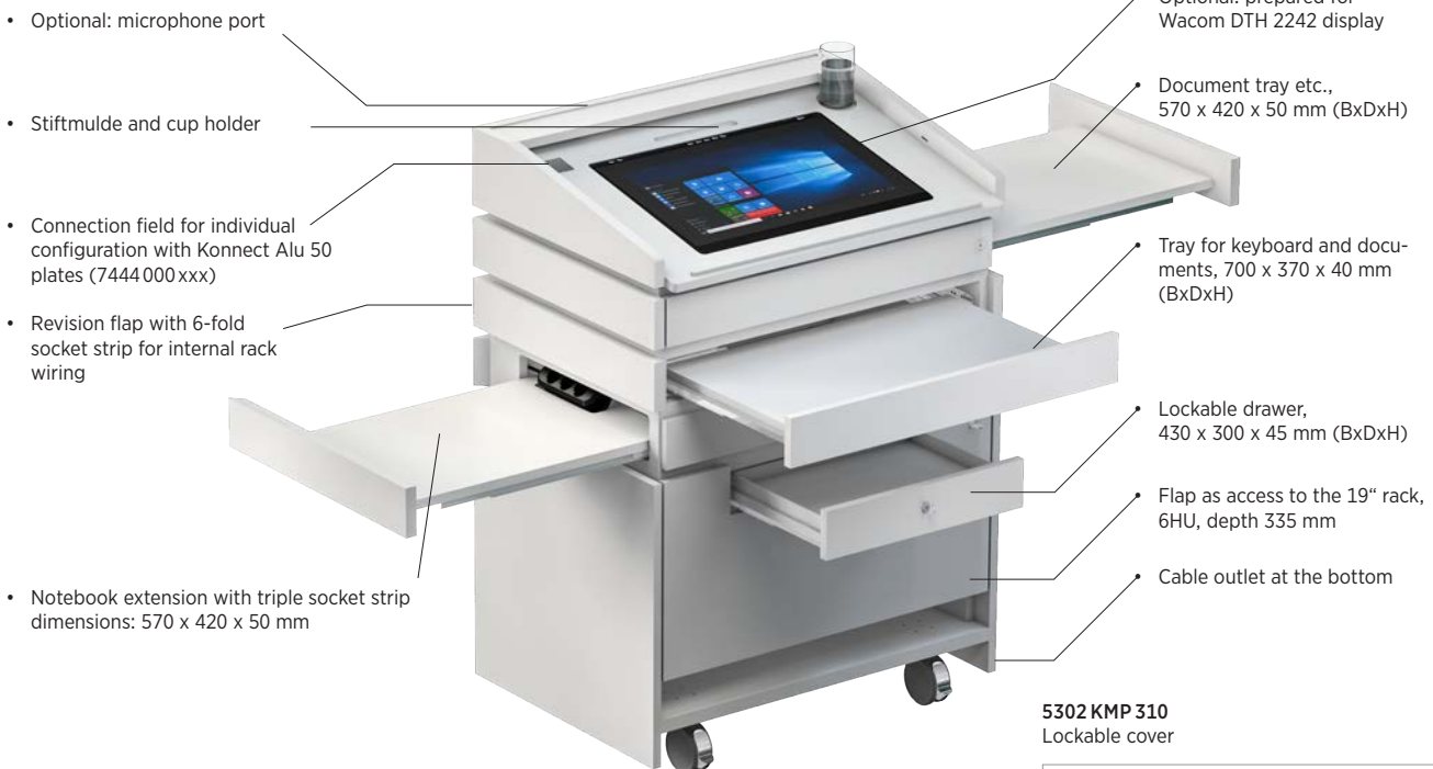
5302 KMP 310 Lockable cover