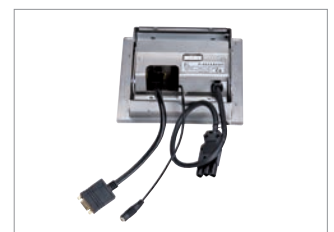
• Connections with cable and plug