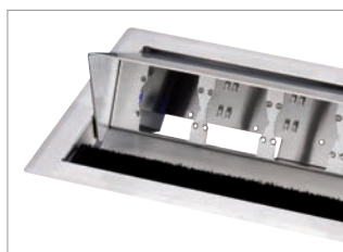
• Empty casing