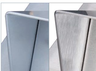
• Powder-coated/stainless steel